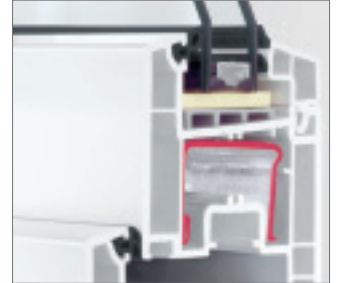
Recessed sash design

You can be sure that your windows stylishly accent your living environment and are harmoniously integrated in the entire architecture of your home. Naturally a high level of thermal insulation is always included.