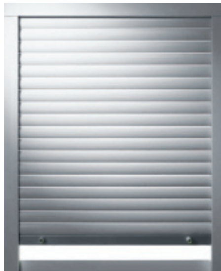
Elegant protection from light, heat and nosy parkers. Comfort-Design Plus

The roller shutter system Comfort-Design Plus provides you with a range of attractive advantages: From visual cover and light protection to thermal insulation. Burglary attempts can be hampered. Construction set 195 is available in classic white with a crank gear or electrical drive option and, if required, with an additional fly-screen.